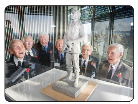
'Battle of Britain' veterans at the unveiling of the maquette Statue of Sir Keith Park at City Hall