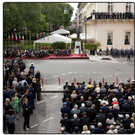
Unveiling ceremony of the statue of Sir Keith Park in Waterloo Place, Wednesday, 15 September, 2010