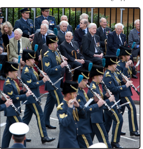
The Band of the Royal Air Force Regiment