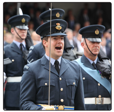
The Guard of Honour of the Queen's Colour Squadron