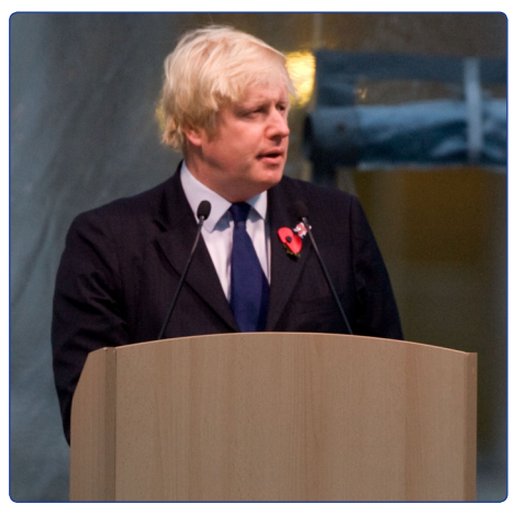
Mayor of London, Boris Johnson addressing supporters in Trafalgar Square