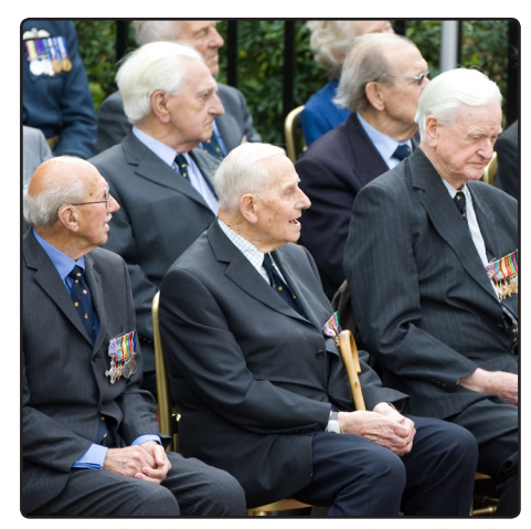
'Battle of Britain' veterans present at the unveiling of the statue of Sir Keith Park in Waterloo Place