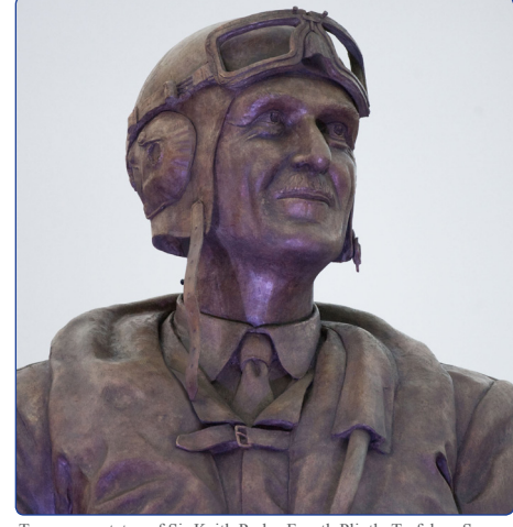
Temporary statue of Sir Keith Park - Fourth Plinth, Trafalgar Squar

Guests then enjoyed a Second World War-themed reception, with the route to the entrance mocked up as an archetypal 1940's London Blitz street. Actors dressed in