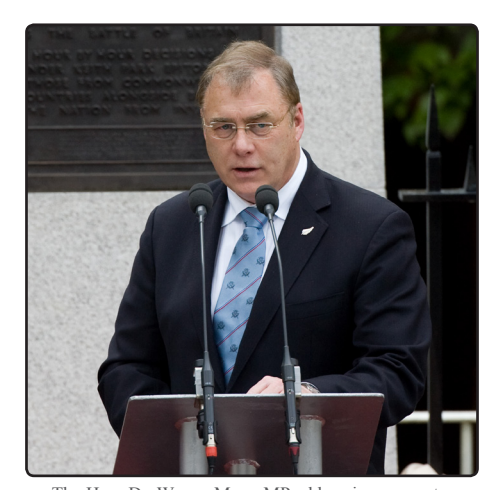
The Hon. Dr. Wayne Mapp MP addressing supporters in Waterloo Place