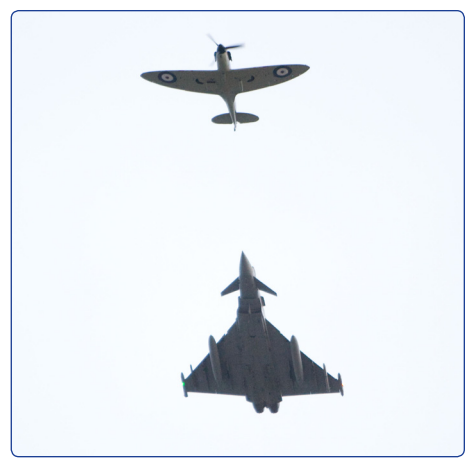
Spitifre and Typhoon Flypast at the unveiling of the Sir Keith Park Statue in Trafalgar Square