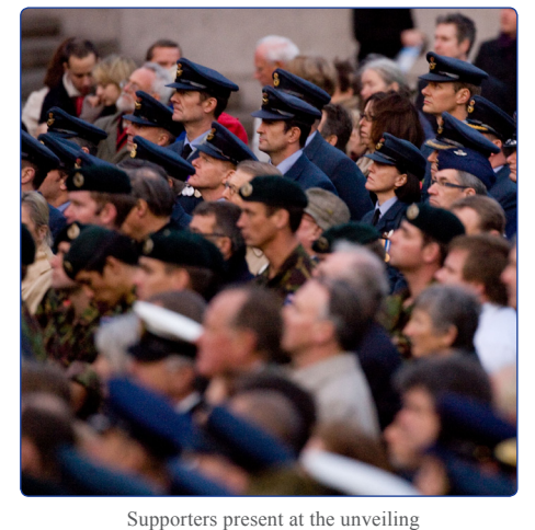
of the statue of Sir Keith Park