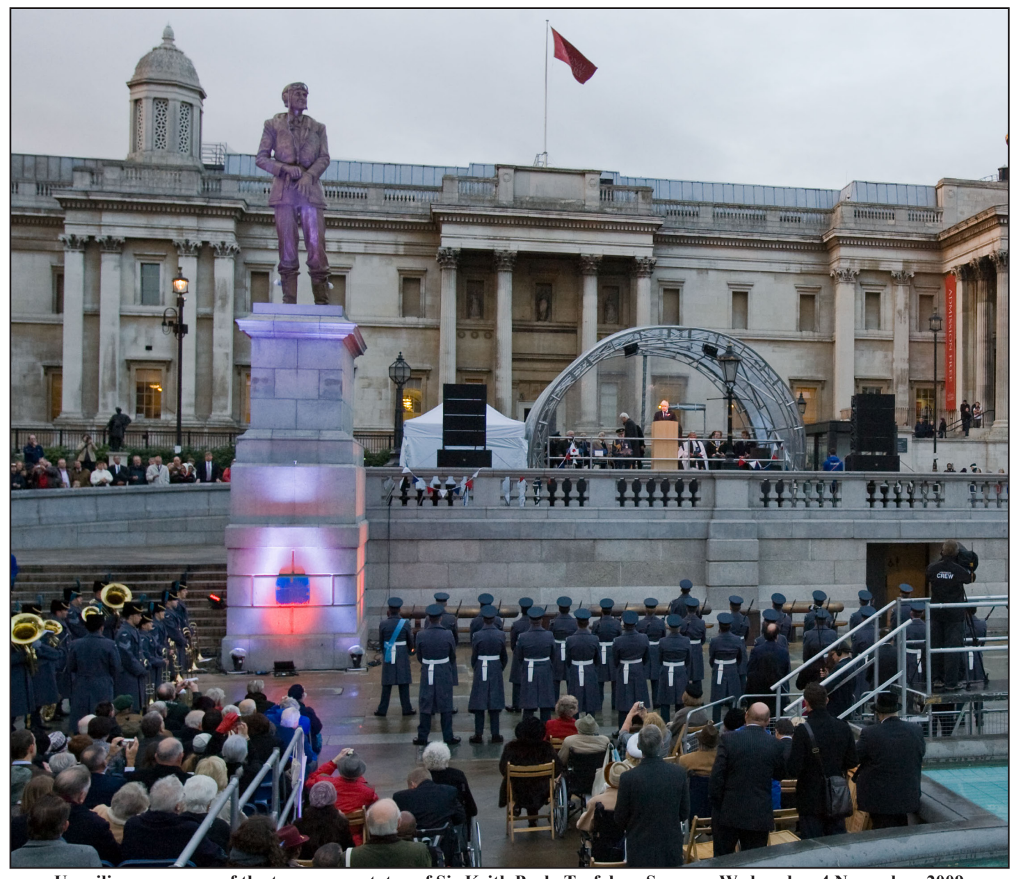
Unveiling ceremony of the temporary statue of Sir Keith Park, Trafalgar Square - Wednesday, 4 November, 2009

For further details please visit: www.rafmuseum.org.uk/london