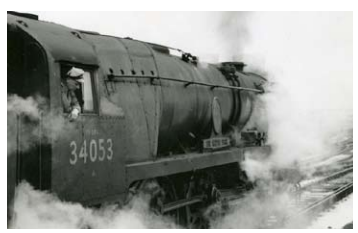
'Sir Keith Park' - Then and Now