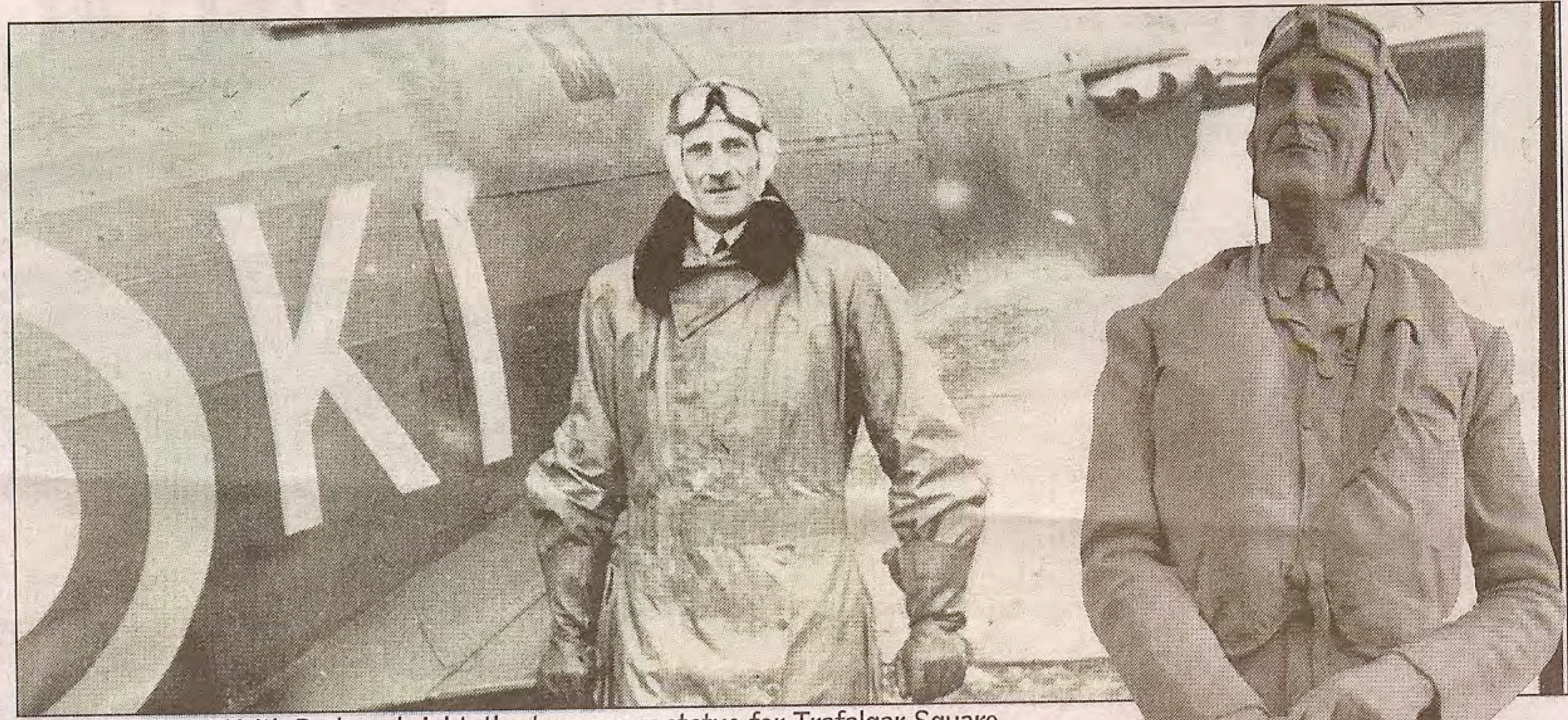
WAR HERO: Sir Keith Park and right, the temporary statue for Trafalgar Square.